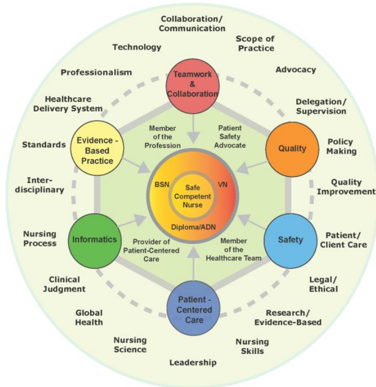
Figure 2: Differentiated Essential Competencies of Graduates of Texas Nursing Programs

References: Differentiated Essential Competencies of Graduates of Texas Nursing Programs (2021) Differentiated Essential Competencies of Graduates of Texas Nursing Programs Evidenced by Knowledge, Clinical Judgments, and Behaviors. https://www.bon.texas.gov/pdfs/publication_pdfs/Differentiated%20Essential%20Competencies%202021.pdf